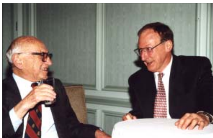
Milton with student, San Francisco, May 2, 2001