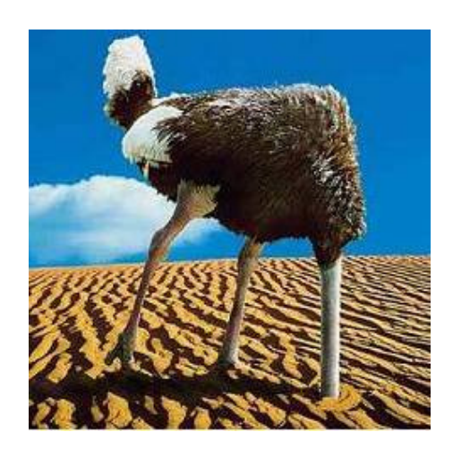
Ostrichus Americanus (GMO)

Those that believe 2008 was a horrible year but there will be smooth sailing from now on are a special breed: