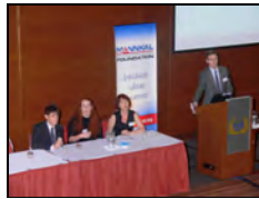
"Session One Panel"