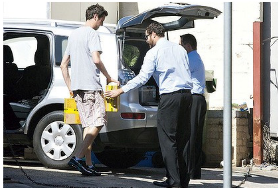
Soy long ... a Luxe Bakery Cafe employee helps health officials load cartons of the soy milk into a car.

A black market trade is operating in the banned soy milk Bonsoy in Sydney cafes, even though retailers face $500,000 fines if caught.