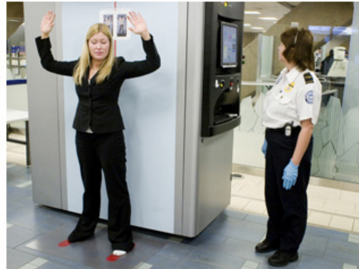
Passengers will be subjected to full-body scans and the removal of shoes at airports.

According to the Herald Sun , domestic travellers can also expect more routine security screening, including swabs to detect explosives.