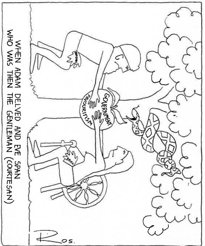
WHEN ADAM DELYED AND EVE SPAN WHO WAS THEN THE GENTLEMAN (COURTESAN)